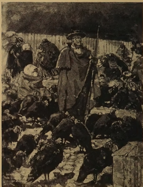
DANIEL URRABIETA VIERGE Barcelona. The Turkey Market